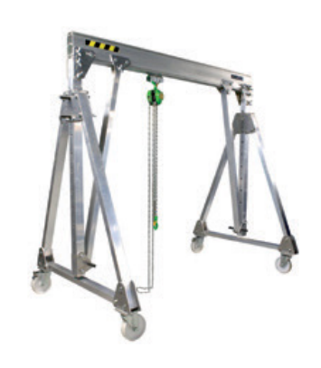
► Aluminium workshop gantry cranes from 250 kg to 2 t.