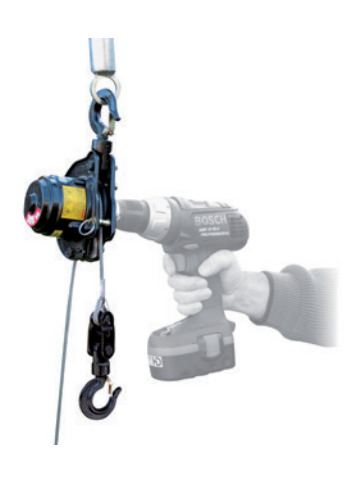
► Multipurpose and portable winch Pulley-Man 300 kg.