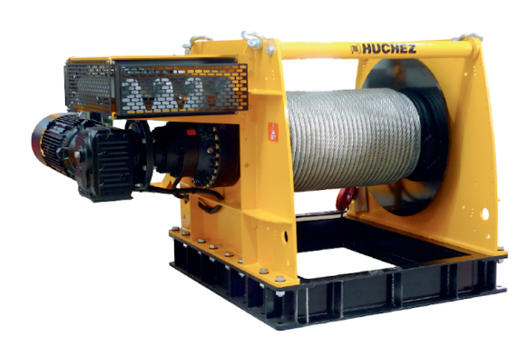
► Koloss up to 35 t in lifting and 50 t in traction/hauling.