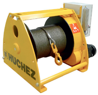
TE from 600 kg to 10 t (lifting only).