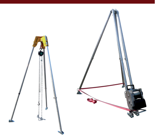
Aluminium telescopic tripods from 250 kg to 3 t depending on models, models for hoist or winches (hoist or winch optional).

Other capacities, dimensions: consult us.