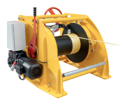
► Trakzio-R up to 15 t in traction/hauling and 40 t in holding.