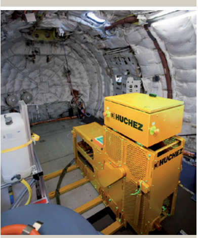
▲ Autonomous flight test winch for acquiring atmospheric pressure measurements. Load: 140 daN, speed: 30 m/min.