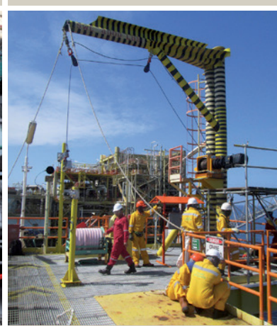
▲ ATEX lifting winch used on an oil platform. Equipment for zone 2 gas (category 3). Capacity: 2,000 kg and lifting speed: 5.5 m/min on the top layer, 60 m of wire rope 12 mm dia.