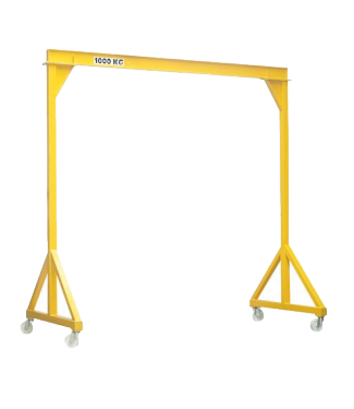
➤ Steel workshop gantry cranes from 500 kg to 6.3 t.