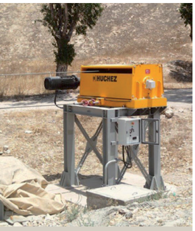
Automatic take-up winch for conveyor belt.