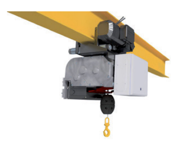
► Trolley for electric winches (Industria or TRBoxter) from 250 kg to 5 t.