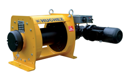
▶ Industria from 1 to 20 t.

► TRBoxter Inox from 250 to 990 kg. For applications in a harsh environment.