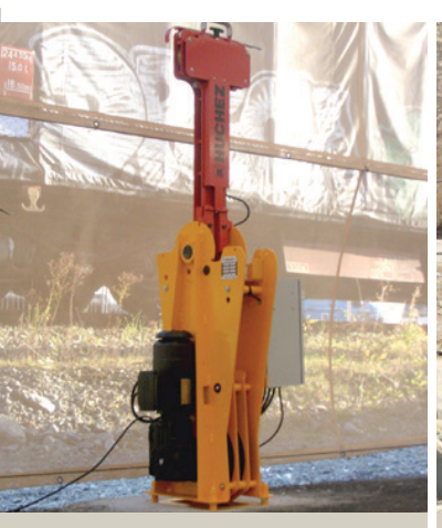
▶ Innovative solution for rapidly loading and unloading railway carriages (Load: 150 daN, 28 m of textile rope 5 mm dia.).