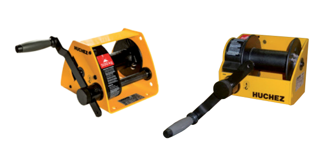
► Manibox GR Spurgear from 300 kg to 2.75 t.