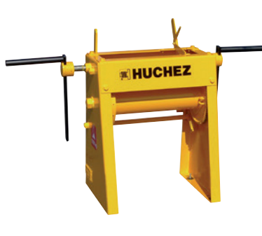
► Pulling crab winch, gear type from 600 kg to 5 t.