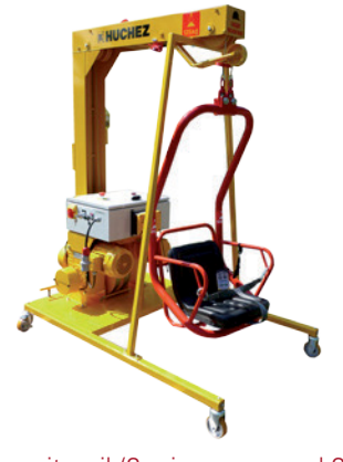
➤ Securitreuil (2 wire ropes and 2 independent winches for maximum safety), 3 working heights: 25, 50 or 70 m.