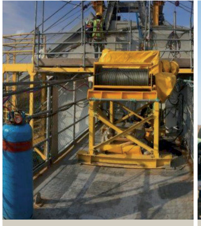
► Set of 2 double-stacked double drum winches designed to move a platform during maintenance work on the shrouds of a bridge in Istanbul (Turkey).