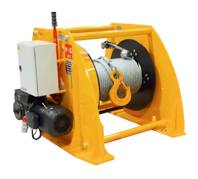
► Trakzio from 1.3 to 15 t. (traction/hauling only).