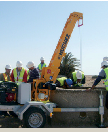
▶ Well inspection mobile crane. Max. useful load: 140 kg (1 person), max. depth of well: 115 m, average lifting speed: 15 m/min (on adjustable speed drive).